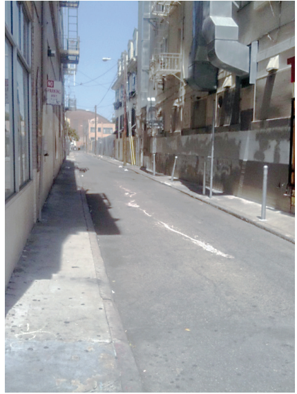
Looking north along Wiese St.