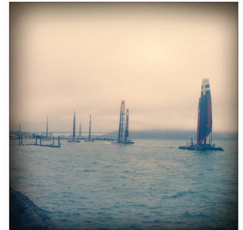
America's Cup activities on the bay before the August meeting.