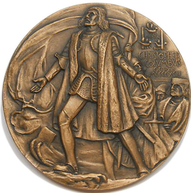
Toivo Johnson Medal Obverses